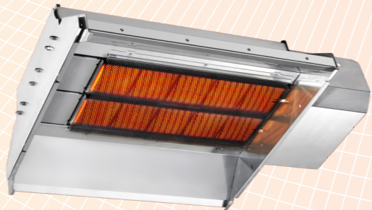
Gas ceramic heaters with increased efficiency - Model XFR 64